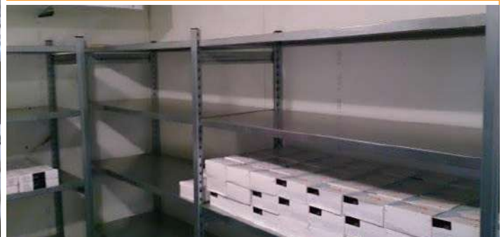
Geita Hospital Medicine Cold Room Installed 2012.