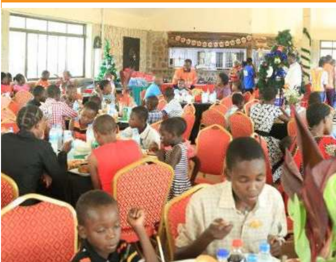
Moyo wa Huruma Orphanage Center Multi-Purpose Hall.