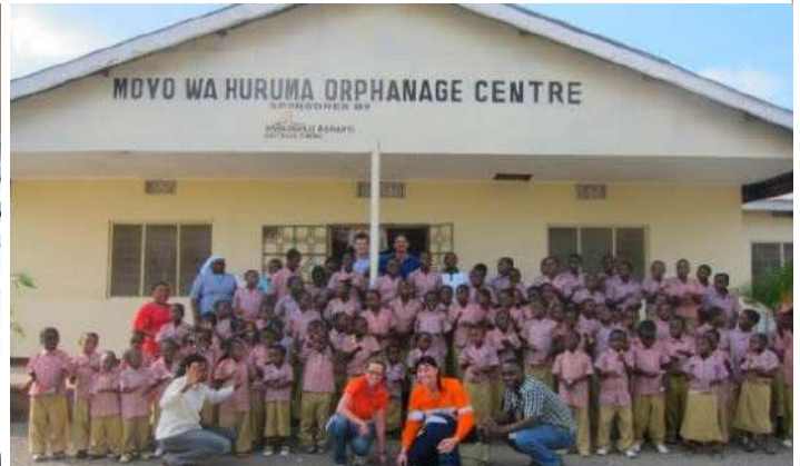
Moyo wa Huruma Orphanage, Geita. Building of additional accommodation and dining facilities. Provision of care staff, food and education to more than 100 Orphans.