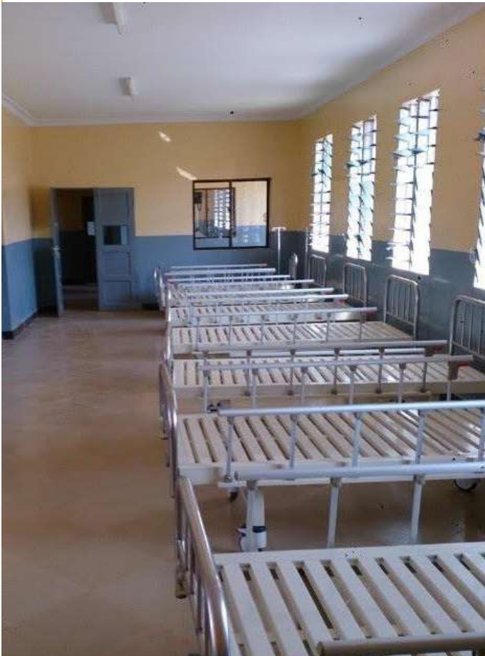
Geita Hospital Delivery Ward Refurbishment 2013.